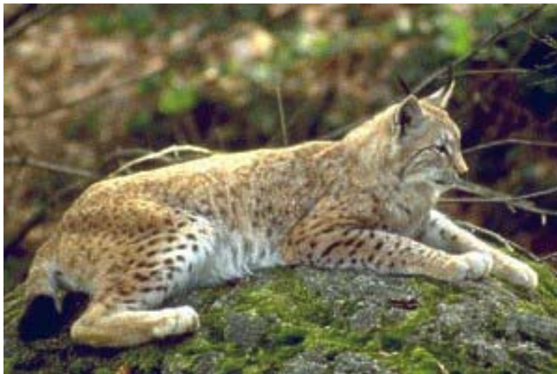
Figure 1: The Eurasian lynx

The ground colour of the fur of the Eurasian lynx is brownish-yellow, but can vary to rusty or reddish brown (Anonymous, 2000). Greyish colours dominate in the wintercoat (Tomkins, 1962). There are three main coat patterns: predominantly spotted, predominantly striped and un-patterned (Anonymous, 2003a). The spotting is dominant in the summer and is almost barely visible in the winter phase (Anonymous, 2000). Pelt colours also vary within and between the species range (see under 'Description'). The colouration of the coat serves as a perfect camouflage in wooded areas (Anonymous, 2003b). Their underbelly and face are of a lighter cream colour (Anonymous, 2003c). The ears have tufts of dark hair and the backsides are black towards the tip, showing light central spots (Anonymous, 2000). Their white whiskers frame their muzzle (Hernandez, 2002). The irises are yellow brown to a light yellowish green colour. Eurasian lynxes have a black tipped tail (Anonymous, 2000). See figure 1.