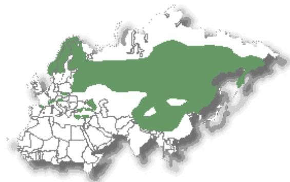
Figure 2: Distribution of the Eurasian lynx (Garman, 2000)

Currently, the Eurasian lynx is found in Europe, the Russian Federation and Asia (Anonymous, 2003a). See figure 2.