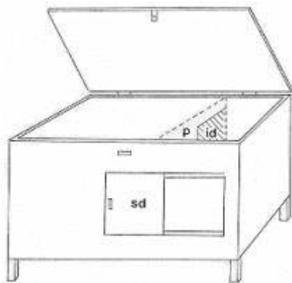
Figure 4: Sample den box that could be used to den pregnant female Eurasian lynxes (Mellen, 2003)

Pregnant females should be provided with at least one den box, preferably two. See figure 4. The den box must allow the female to stand up and turn around in the back half of the den box. The box should have a sliding door in the front of the box to provide easy access. The hinged lid must have a 20 centimetres overhang at the front and 10 centimetres at the sides to prevent water getting into the box during cleaning or inclement weather. The box should contain a partition that limits light and draughts, providing additional seclusion for the female and cubs. Wood shavings can be provided as a substrate. The den box should be placed on the floor of the enclosure with legs that raise the box 10 centimetres of the ground. Den boxes can be made of wood or plastic (Mellen, 2003).