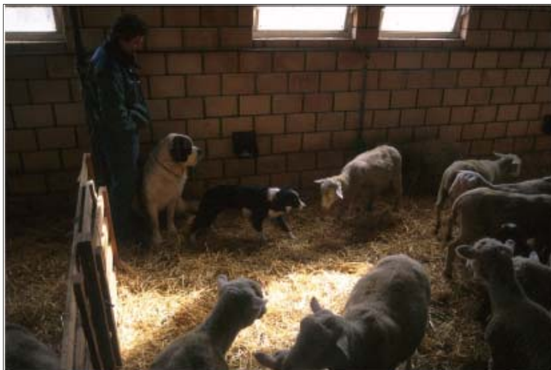
Figure 3: Border collie stalking a sheep while the St-Bernard remains neutral

A guard dog which is not loyal does not necessarily have predation behaviour, but it tends to play with the sheep as it would play with other dogs (Coppinger et al. 1987). If the sheep does not react or stops in its flight, the dog seeks another playmate or else the dog's play behaviour turns into an investi-