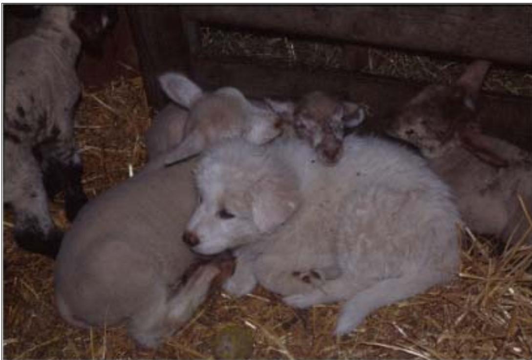
Figure 2: A two months old Great Pyrenees with lambs

As adults, guard dogs have a tendency to keep the