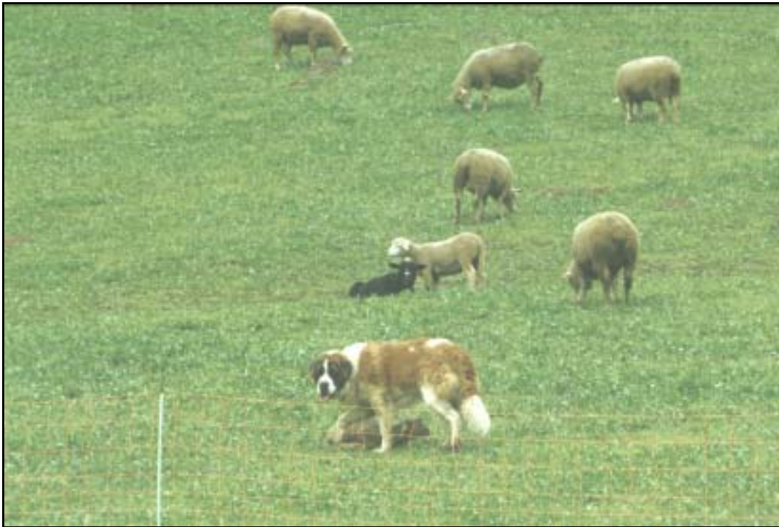
Figure 5: St-Bernard guarding a flock in the canton of Valais