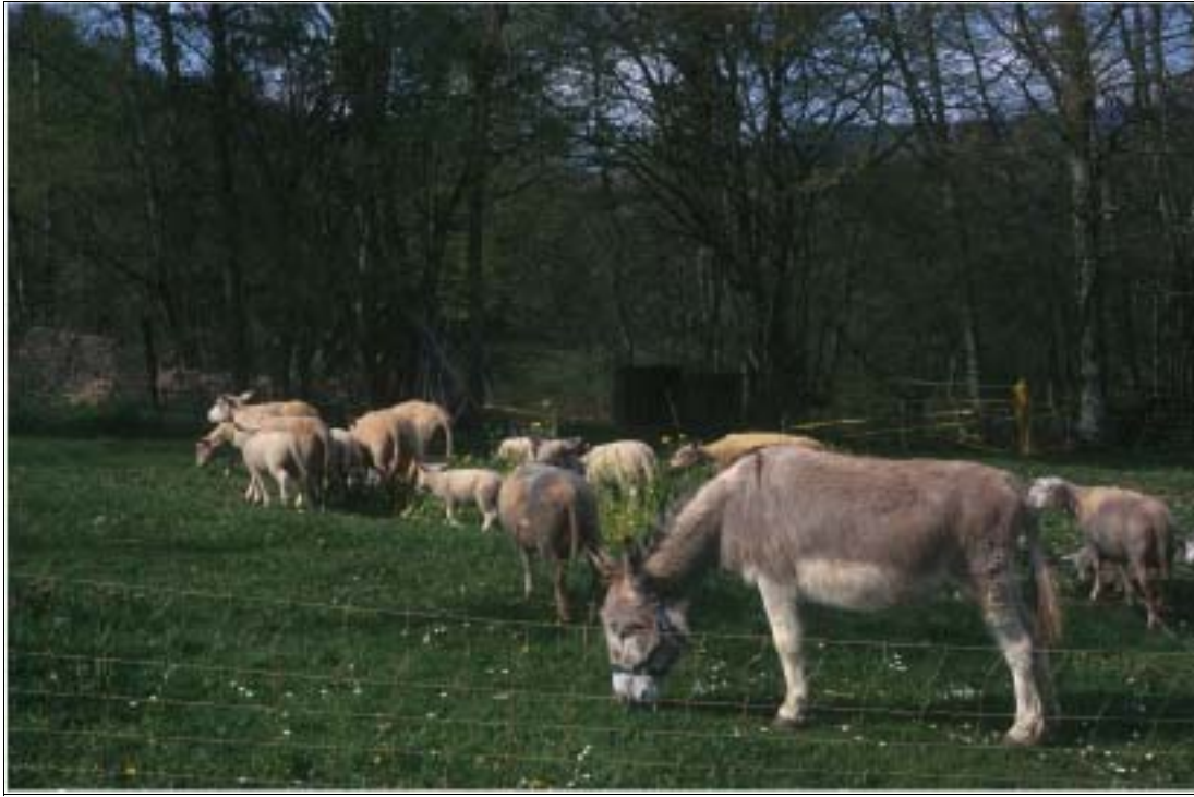
Figure 4: Donkey in a flock of sheep

(1988), Raveneau & Daveze (1994) and Bourne (1994) is the donkey. At present, 78 races are recognised by the FAO (Food and Agriculture Organisation). The donkey is believed to have been domesticated more than 5000 years ago from a wild ass Equus asinus nubicus , which is still found today in the Sudan (Raveneau & Daveze 1994). Depending on the race and individual, weights can vary from 80 kg (dwarf races) to 480 kg (Baudet du Poitou) (Raveneau & Daveze 1994). In numerous engravings and pastoral stories, the donkey is found in the middle of the sheep (Pitt 1988). The donkey was, and is still, used in many mountain regions for the transport and provisioning of shepherds in summer (Pitt 1988). The donkey can today be an excellent guard (Fig. 4), able to give warning by loud and unusual braying at any problem or of an inopportune visit. Its aversion for canids seems to be used in many European countries. It is used to guard herds of sheep, goats and cows. Its presence is particularly effective against stray dogs and foxes (Pitt 1988, Raveneau & Daveze 1994). Female donkeys are also good guards, on condition that they are not pregnant, since they are at risk of aborting (Raveneau & Daveze 1994).