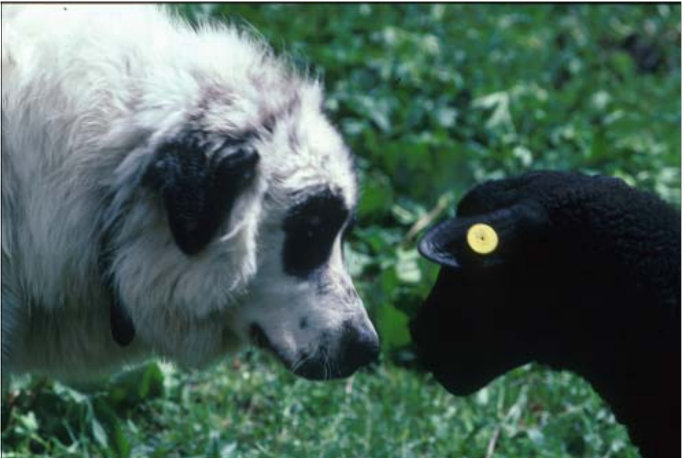
Figure 1: The guard dog Orlando sniffing the nose of a lamb