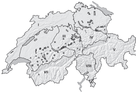
Figure 2: Information about reproduction from three different sources: chance observations = triangles, dead lynx or lynx removed from the wild = stars and opportunistic camera-trapping = squares.

Slika 2: Informacije o reprodukciji iz treh različnih virov: naključna opažanja = trikotniki, mrtvi risi ali risi odvzeti iz narave = zvezde in oportunistični posnetki s foto-pastmi = kvadrati. Table captions.