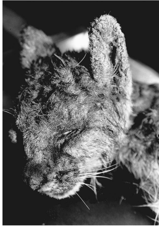
FIGURE 2. Head of Eurasian lynx affected by mange. In this case, there was a mixed infection with Notoedres cati and Sarcoptes scabiei . Notice the thick crusts covering the pinnae and the face and mild alopecia.

All carcasses were immediately brought to the Centre for Fish and Wildlife Health (Berne, Switzerland) for complete standard necropsy. Mange mites were stimulated by light and increased temperature and migrated out of skin samples onto the lid of Petri dishes (Bornstein, 1995). The mites were examined by light microscopy and identified on the basis of typical morphologic characteristics (Neveu-Lemaire, 1938; Sloss and Kemp, 1978; Kettle, 1984). Notoedres cati was isolated from the skin of lynx 1 and 2 and S. scabiei was isolated from lynx 3 and 4. Both mite species were present on lynx 5. Representa-